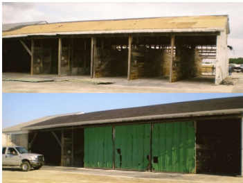
Original building with wood-braced walls to separate the bays