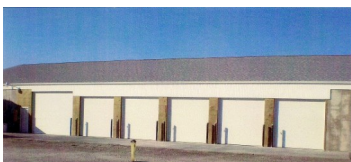
New concrete reinforced walls and metal entrance wall guards